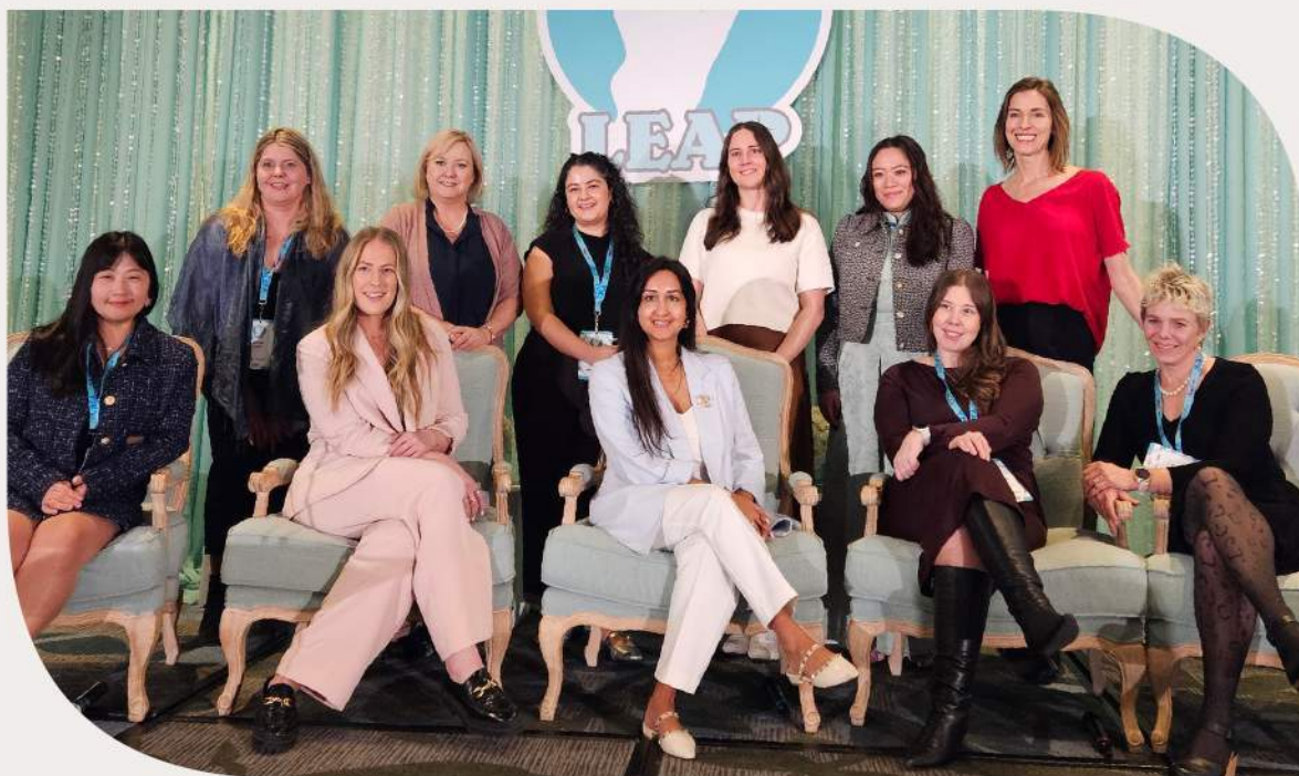
2026 BOARD OF DIRECTORS

Since 1981, CCW has been inspiring and supporting women to build a stronger construction industry.